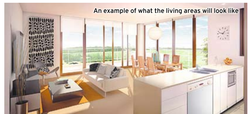
An example of what the living areas will look like