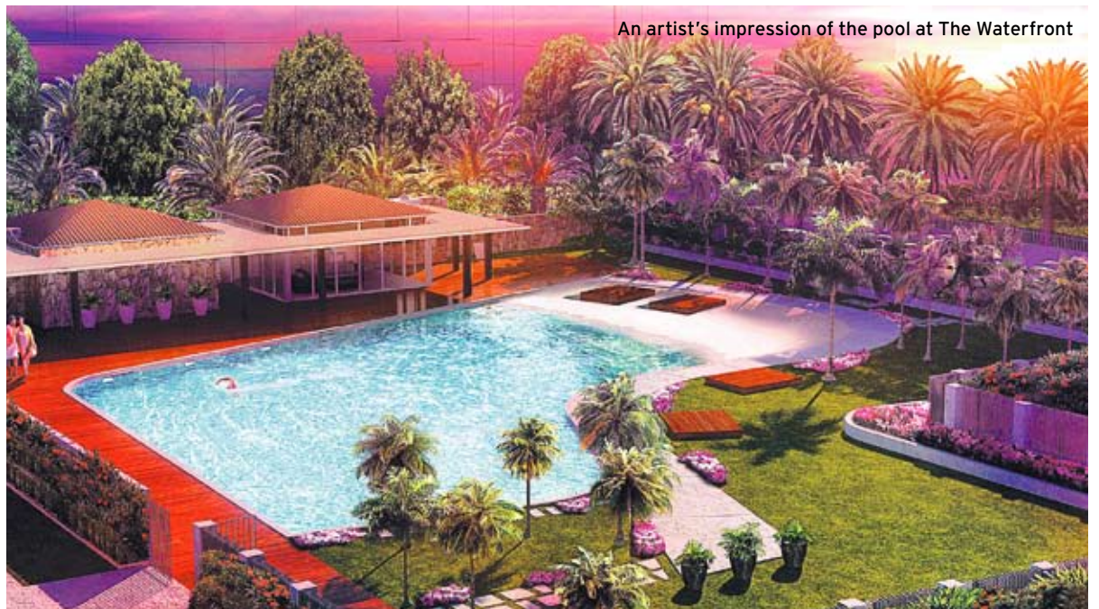
An artist's impression of the pool at The Waterfront